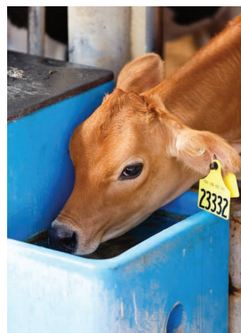
Dairy farmers use self-refilling bowl and trough systems so their cows always have fresh water whenever they want, minimizing waste!