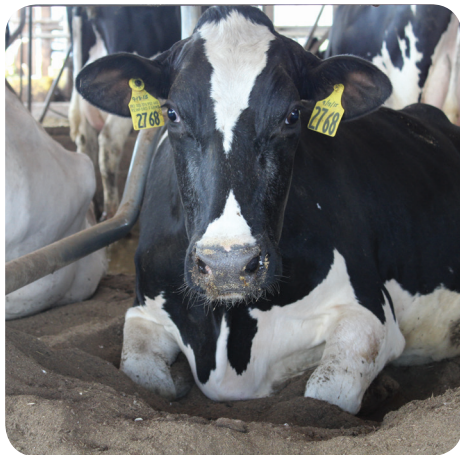
Dairy cows on recycled bedding at Reinford Farms in Mifflintown, Pa.