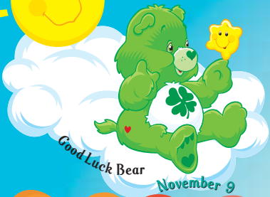
Good Luck Bear