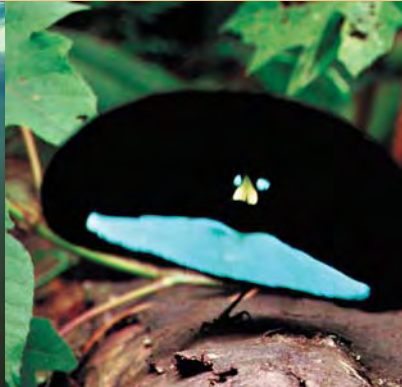
Bird of Paradise

Explain to students that each of the habitats they have learned about is