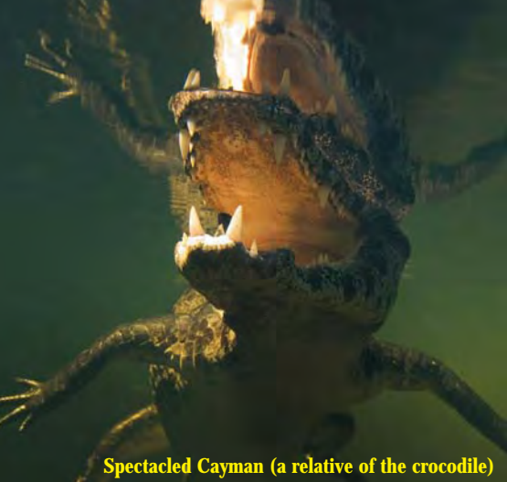
Spectacled Cayman (a relative of the crocodile)