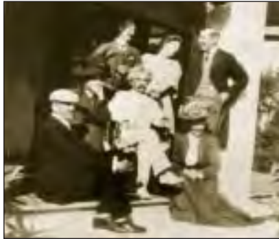
The Mark Twain House, Hartford

S amuel Clemens, who came to be known as Mark Twain, was a natural-born storyteller who was the first writer to recognize that art could be created out of the American language. Through his use of carefully chosen words and his sharply honed humor, he dealt head-on with controversial issues that others were afraid to confront.