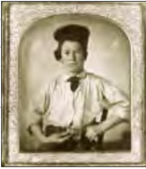
Young Sam Clemens around age 14 as a printer's apprentice.