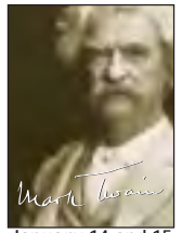
January 14 and 15 on PBS

“Whatever you have lived , you can write—& by hard work & a genuine apprenticeship, you can learn to write well ; but what you have not lived you cannot write, you can only pretend to write it...”