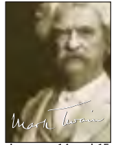
January 14 and 15 on PBS

A fish story is a story that exaggerates the truth—the way the fish he caught gets bigger every time the fisherman tells his story about it. What's the best “fish” story that you've ever heard? Share it with your classmates.