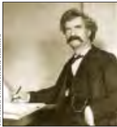
The Mark Twain House, Hartford

We had set the above head up, expecting (of course) to use it, but as the accident hasn't happened, yet, we'll say — To be Continued.