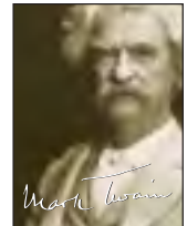
January 14 and 15 on PBS

“The old saw says, ‘Let a sleeping dog lie.’ Right. Still, when there is much at stake it is better to get a newspaper to do it.”