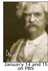
January 14 and 15 on PBS

"... I have no race prejudices , and I think I have no color prejudices nor caste prejudices nor creed prejudices. Indeed I know it.... All that I care to know is that a man is a human being —that is enough for me..."