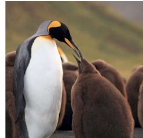
___ Feeding time!