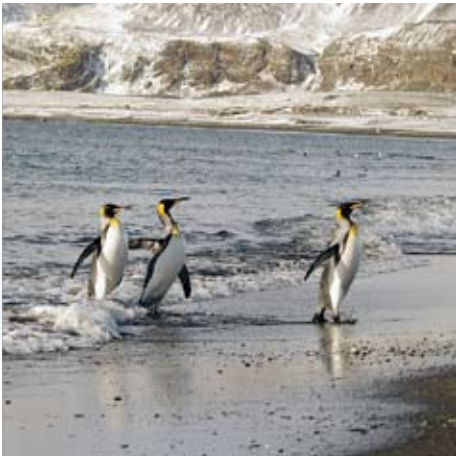
___ Finding food for the chick