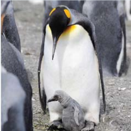
___ Just hatched!

King Penguin parents work hard. It takes more than a year for their chick to grow big enough to live on its own. Look at these pictures of the King Penguin parents and their chick. Number the pictures to put them in the right order.