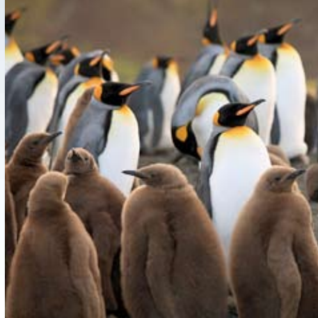
___ Protecting the crèche