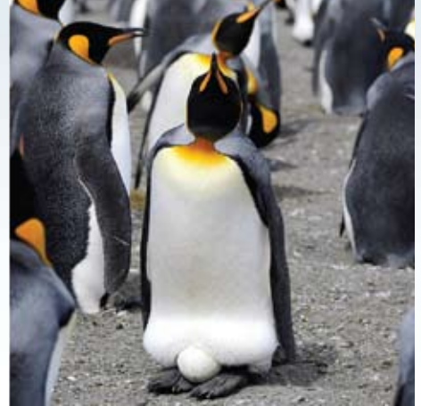
___ Protecting the egg