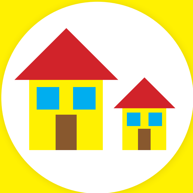
Big house. Little house. Who lives inside?