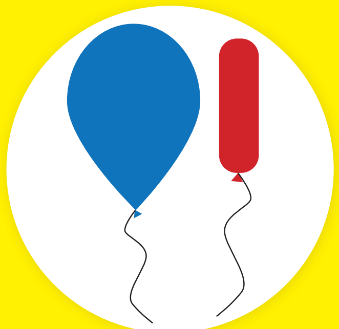
Large balloon. Small balloon. Which one is wide?