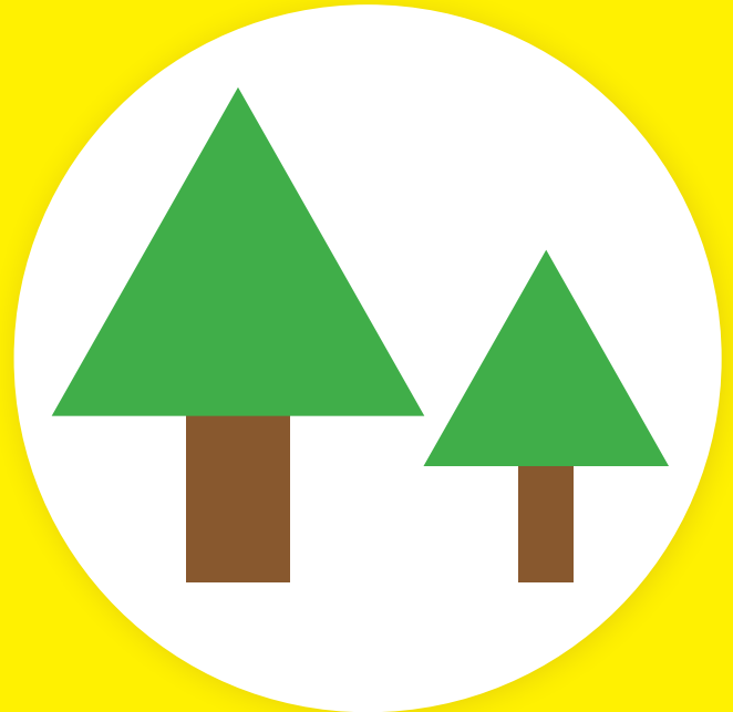
Tall tree. Short tree. Where are they growing?