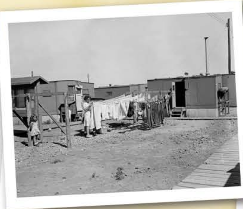
Housing for the workers at Los Alamos, New Mexico.