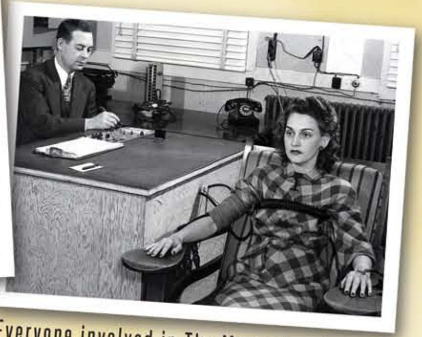
Everyone involved in The Manhattan Project was subjected to lie detector tests.