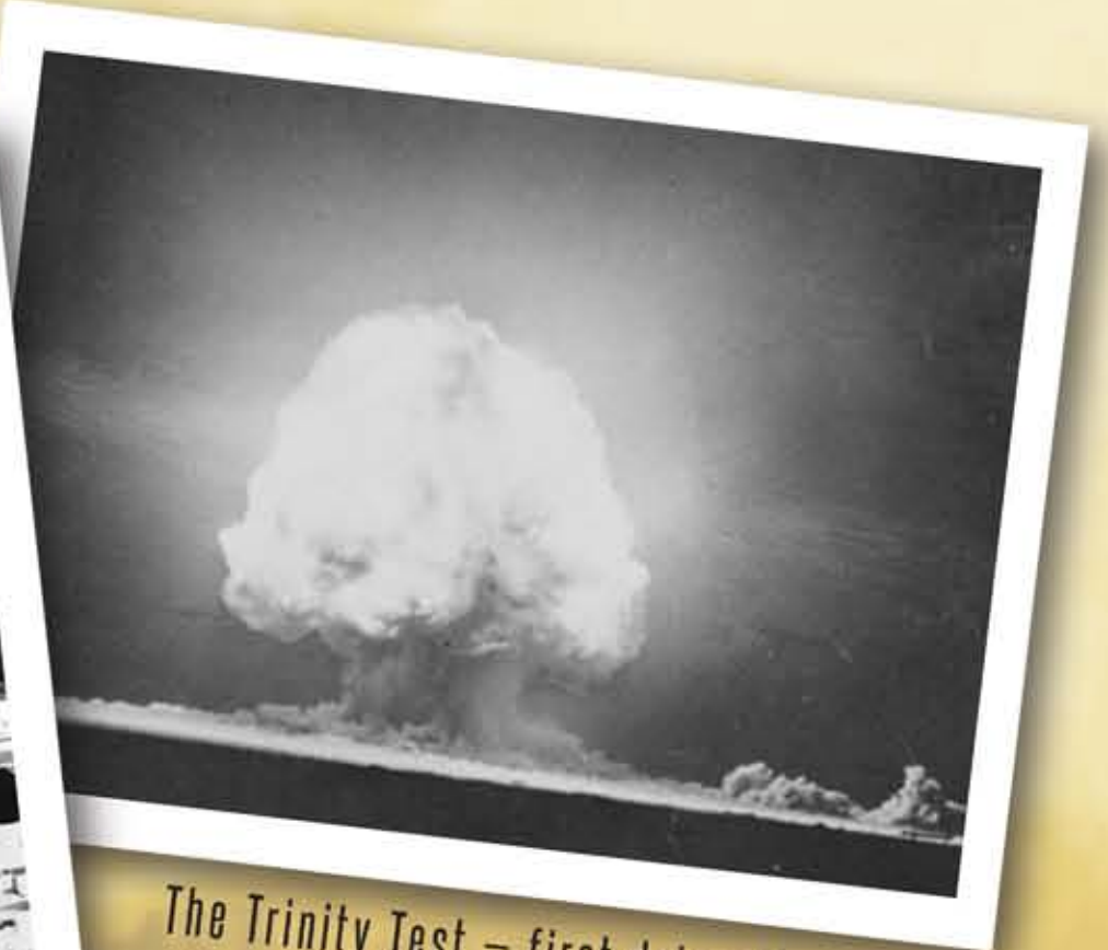
The Trinity Test – first detonation of an atomic bomb, July 16, 1945.