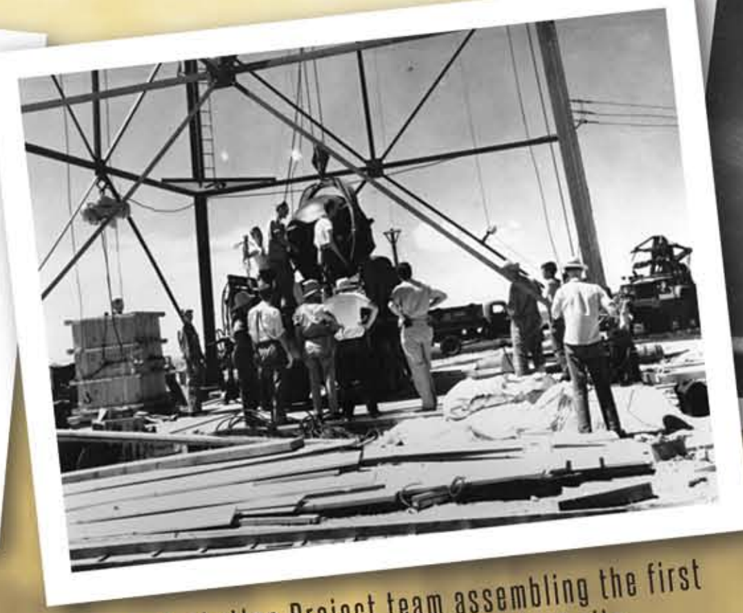
The Manhattan Project team assembling the first atomic bomb at the Trinity test site.