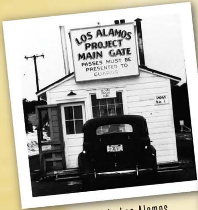
Entrance to Los Alamos.

SEASON 2 PREMIERES ON WGN AMERICA TUESDAY, OCTOBER 13, 9PM/8C