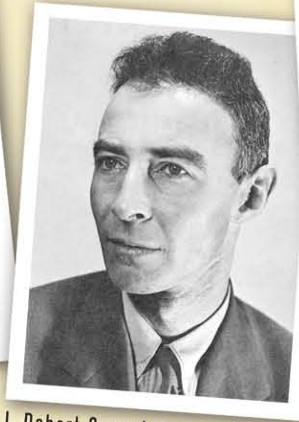
J. Robert Oppenheimer, called the "father of the atomic bomb."