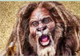
4. Lion _____

c. A quick-witted fast-talker who thinks he's empty-headed. He wants the Wiz to give him a _____.