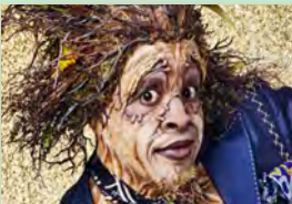
2. Scarecrow _____

a. Sensitive and caring, he feels hollow inside. He wants the Wiz to give him a _____.