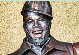
3. Tin Man _____

b. A show-off who backs down when he's challenged. He wants the Wiz to give him _____.