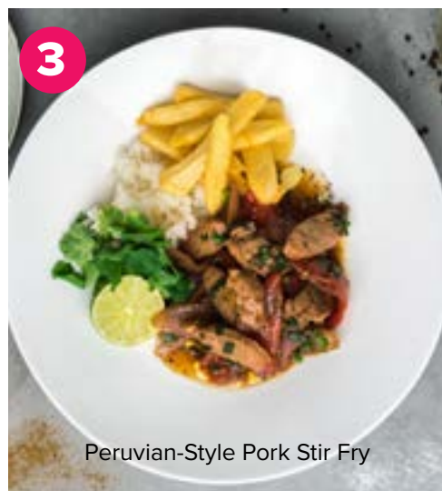
Peruvian-Style Pork Stir Fry