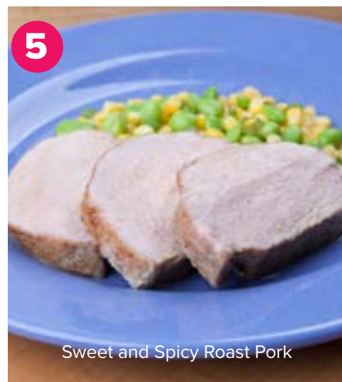
Sweet and Spicy Roast Pork