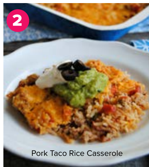
Pork Taco Rice Casserole