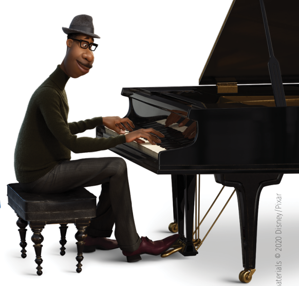
"Soul" Materials © 2020 Disney/Pixar