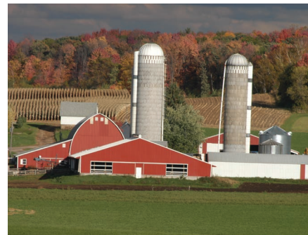
Wisconsin dairy farmers are committed to recycling and maintaining ecological balance throughout all aspects of their farms.

Today's dairy farmers use sustainable farming practices to protect the environment by conserving energy and water, reducing pollution, and building soil health. Soil health refers to the soil's ability to function as an ecosystem that can support plants, animals, and humans.