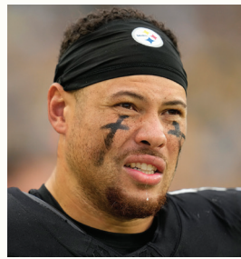
Alex Highsmith Pittsburgh Steelers

During his team's first home game, Alexander surprised two families with free game tickets, t-shirts, and $1,000 to help with everyday expenses. Each year, he donates money to scholarships to help students at his former high school and offers youth life skills/football camps.