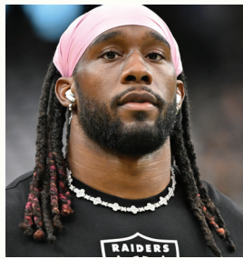
Alexander Mattison Las Vegas Raiders