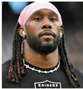
Alexander Mattison Las Vegas Raiders