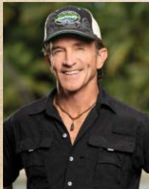
Survivor host Jeff Probst

Questions? Contact YMI toll-free at 1-800-859-8005, or by email at feedback@ymiclassroom.com .