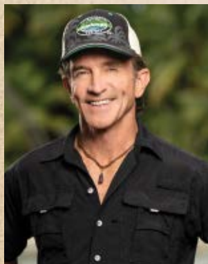
Survivor host Jeff Probst

Questions? Contact YMI toll-free at 1-800-859-8005, or by email at feedback@ymiclassroom.com .