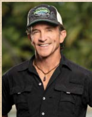
Survivor host Jeff Probst

Questions? Contact YMI toll-free at 1-800-859-8005, or by email at feedback@ymiclassroom.com .