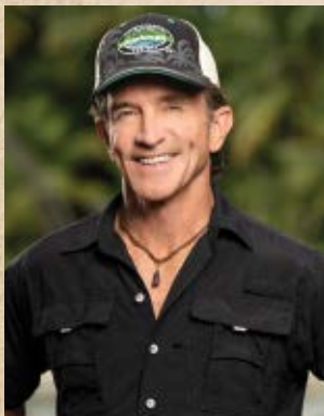
Survivor host Jeff Probst

Answers: Part 1: Answers will vary but could include the following: 1. The climate is warm year-round. It has a hot, wet season and a drier, cooler season each year.